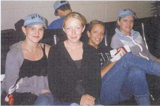
Will we ever take off?

One hour after leaving Heathrow, the Captain announced that one of the four engines had overheated and they had to return to Heathrow. The result was a night at the 'posh' Renaissance Hotel, a morning coach transfer to Gatwick and a half empty plane in which to stretch out. 'As a special birthday treat I went up to the cockpit and spoke to the Captain who took the name of the orchestra and mentioned it on the loudspeaker later on. We landed at 4.10pm USA time, too excited to feel tired and were struck by the weather - very hot and sticky.'