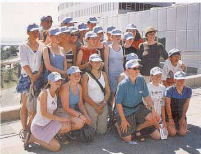
Gathering on the Newseum roof after a fire alert

So 36 hours after leaving Queenswood, the group arrived leaving them none of the planned time for acclimatisation or rehearsal. The first full day was very hectic with a morning rehearsal in the Kennedy Centre, an afternoon one on the Millennium Stage itself and the performance that evening not only to a packed hall but to many more for whom it was recorded on the internet where it remained accessible