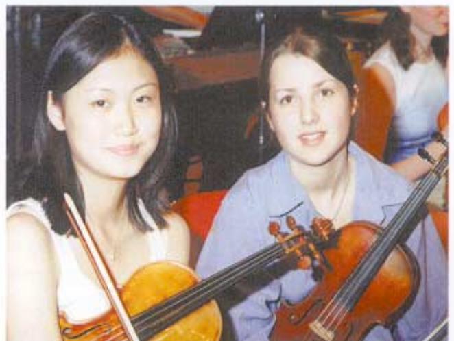
A pause in rehearsals for two violinists

Food figured large in the group's experiences: 'a large American pizza to an English person is a gigantic one' . On one evening, accompanying parent Mrs Wong organised a delicious Chinese meal for everyone at a local restaurant