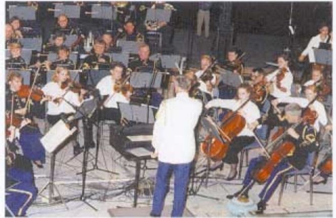
Performing with the army band on Capitol Hill

Tuesday, July 27, 1999 at 6:30 p.m. Audelia Bello Auditorium Washington, D.C.