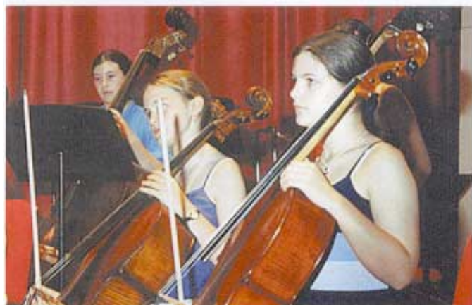
Cellists in rehearsal at the Kennedy Centre

For everyone, the Washington Tour was a great experience: the hours of practising were rewarded by highly appreciative audiences at concert venues, the sight-seeing, the food, the shopping... 'We all felt we had a wonderful, rewarding holiday