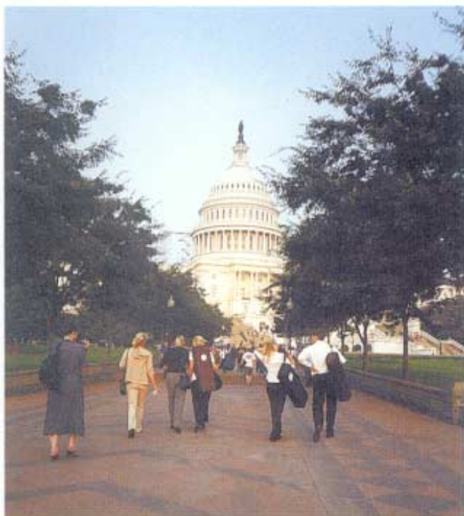
On the way to Capitol Hill

The tour to Washington D.C. this summer was a resounding success. All three concerts were of a high standard and enthusiastically received by large appreciative audiences. Standing ovations were part of the fun so that, at our last concert in the IDB Cultural Centre, we simply had to play an encore which caused some confusion as music had been left backstage. We have an invitation to return to Washington in 2001! We had a wonderful day with the Army band, culminating in the joint concert outside the Capitol building. As I was conducting Holst's St Paul's Suite, I looked up to